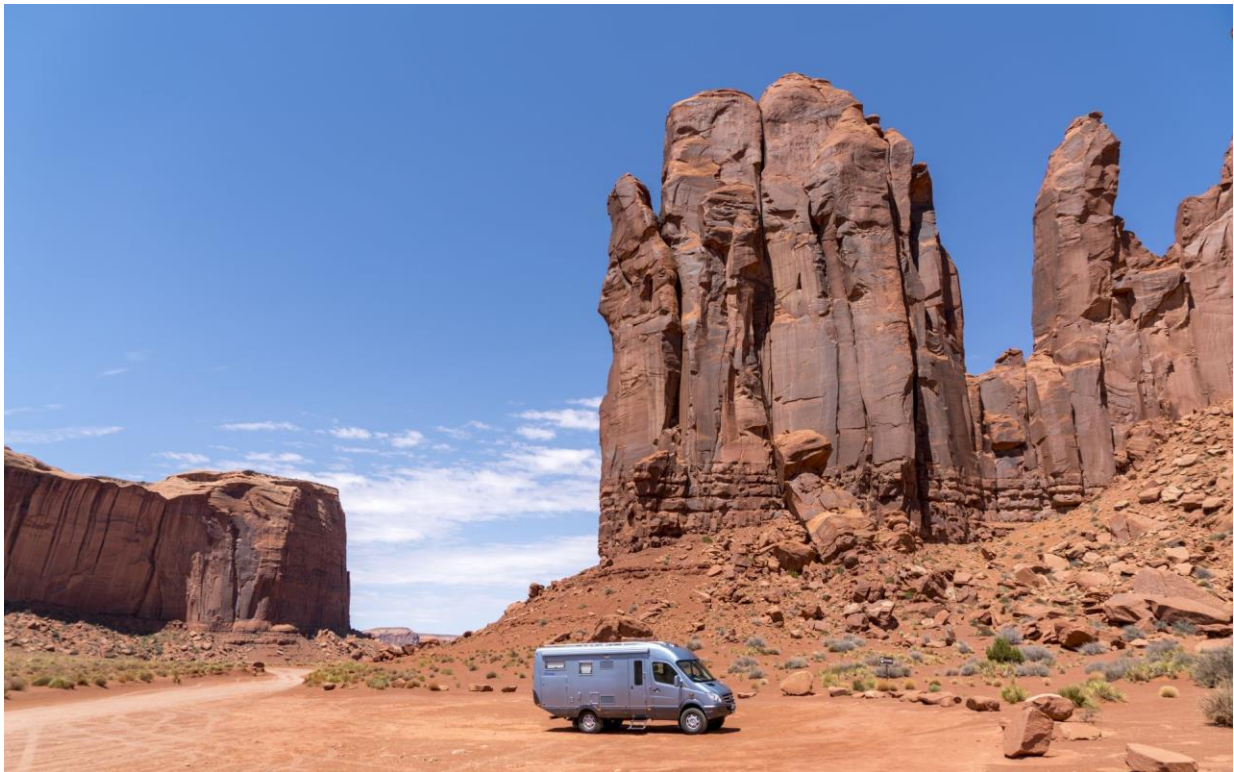
Monument Valley, USA