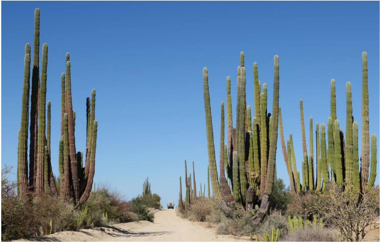
Baja California, Mexico