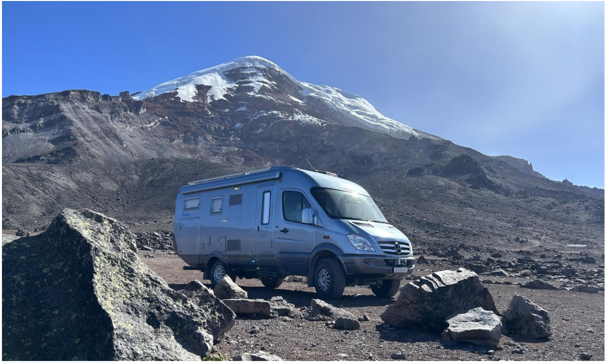
4800 m, Chimborazo, Ecuador