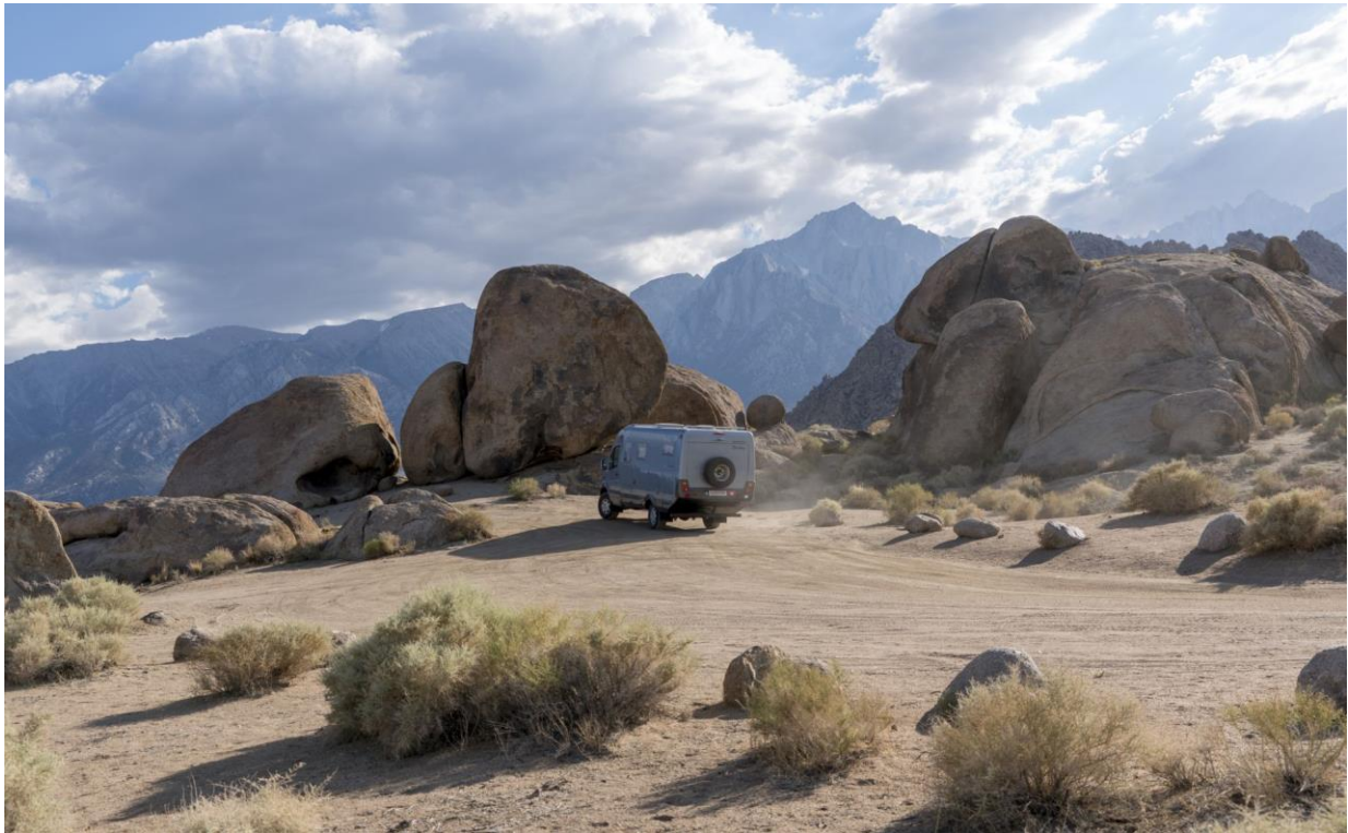
Alabama Hills, USA