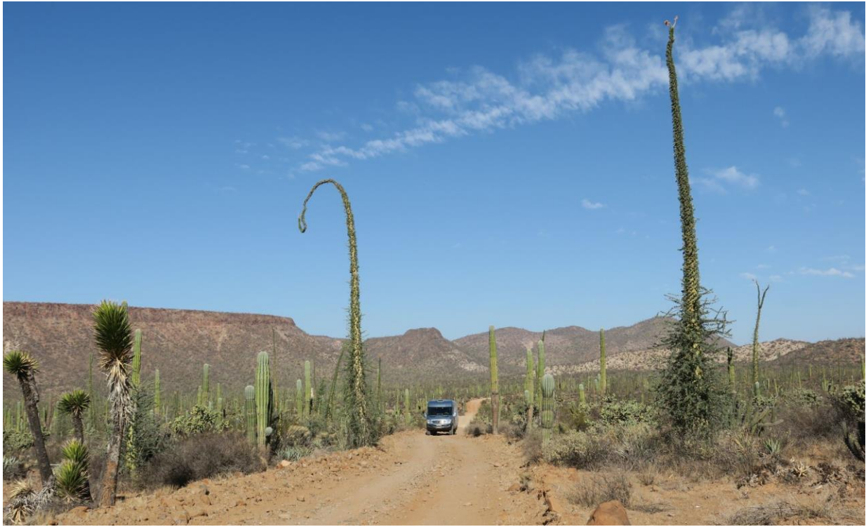
Baja California, Mexico