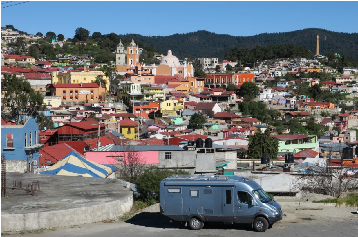
Mineral del Monte, Mexico