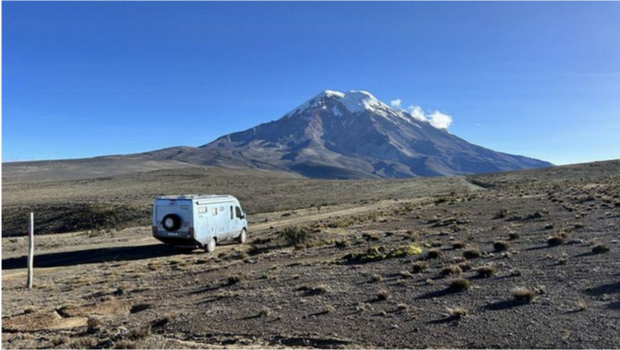
4240m, Chimborazo, Ecuador