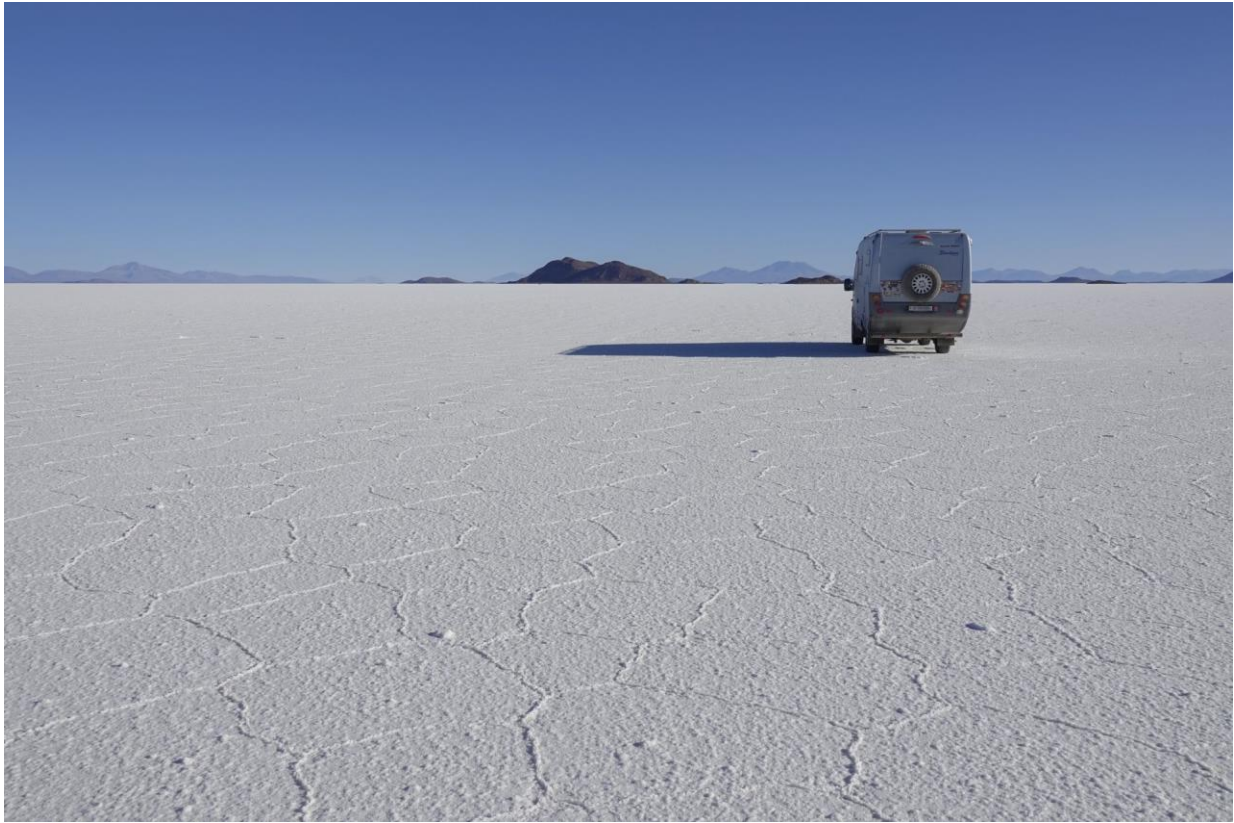
Salar de Uyuni, Bolivia