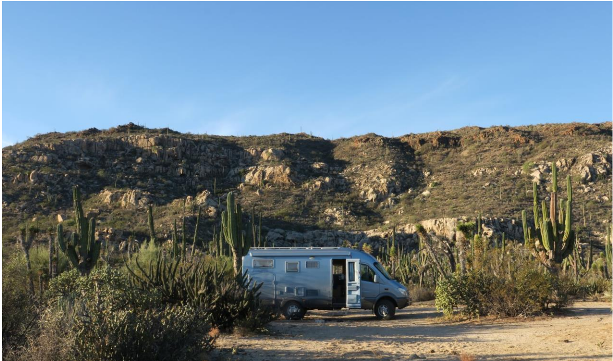
Baja California, Mexico