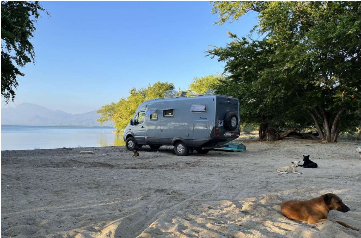
El Marqués, Mexico