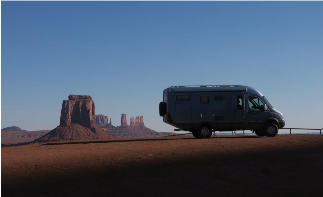
Monument Valley, USA