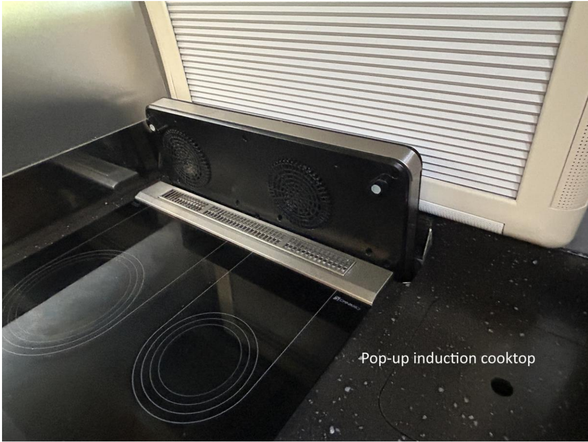
Pop-up induction cooktop