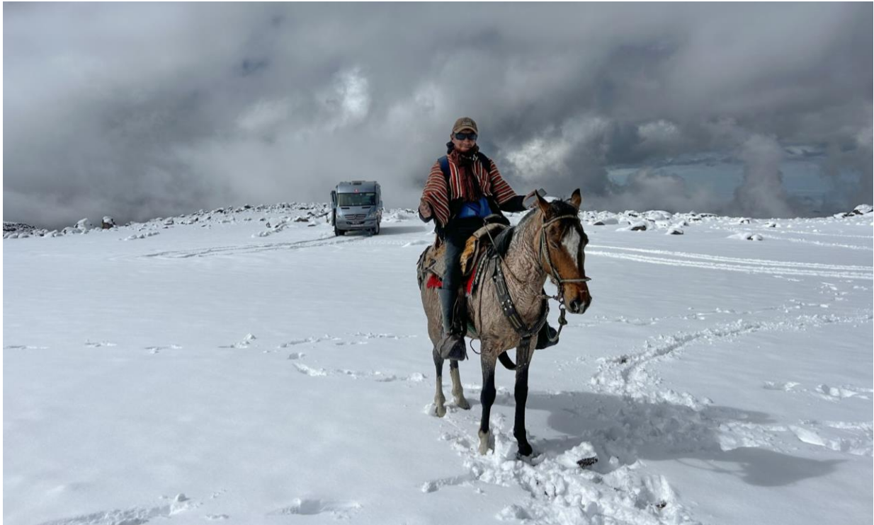
4860 m, Chimborazo, Ecuador